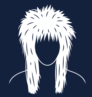
80s theming and production