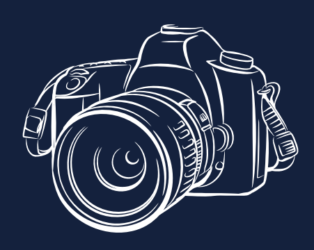
Funky Photo Booth