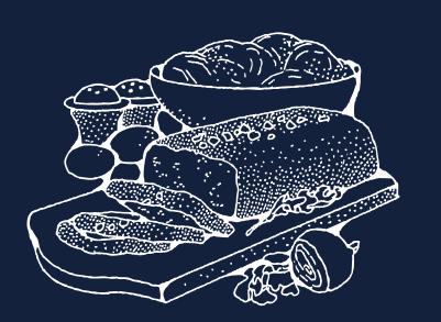
A Three Course Seated Dinner