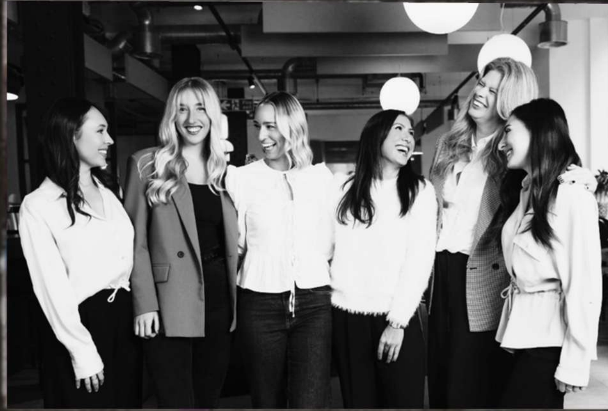
6 0 3 6