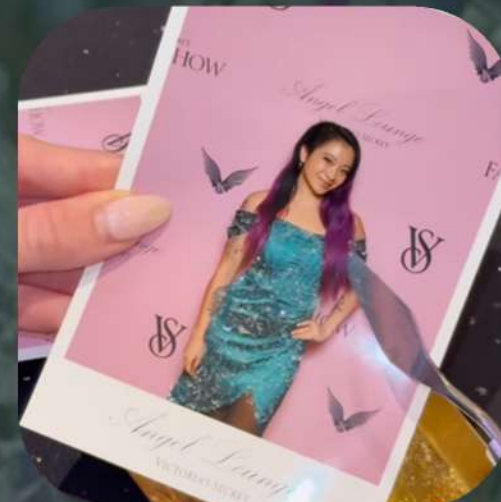
Glittered photo artist