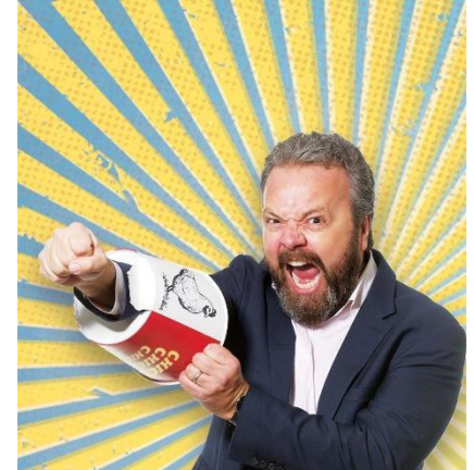
Starring Hal Cruttenden and support https://bit.ly/2EFTVHv